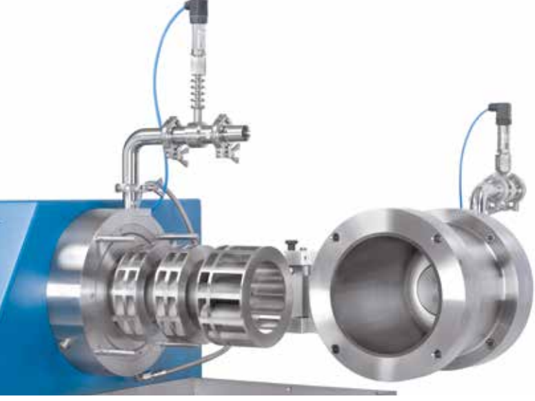
DYNO®-MILL ECM-AP 10

For decades, WAB has been a leading specialist in the field of grinding and dispersion with thousands of the world famous DYNO®-MILL products installed worldwide. The many products that are required to be milled demand contact material of the highest quality. With its extensive program of mills and experience gained over decades, WAB delivers the right solutions for all machines and products to ensure that you produce the finest quality products in a repeatable process.